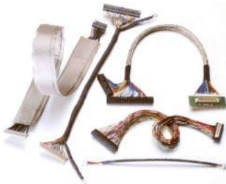
Cable & Harnessing