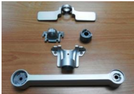
Die Casting / Machining