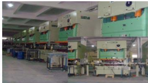
High/Low Volume Sheetmetal